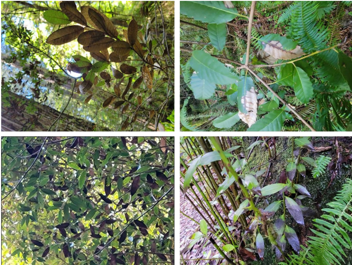
Figure 2. Suspected Calonectria californiensis symptoms on (top) tanoak and (bottom) bay laurel, from Del Norte County, CA and Curry County, OR. In the second tanoak photo, note that the infection does not involve the twigs or petioles, as is typical with symptoms caused by Phytophthora ramorum .

infection on bay laurel appear identical to those caused by P. ramorum . Extensive pathogen infection of bay laurel usually occurs in humid areas such as river canyon bottoms, and defoliation is usually confined to the bottom two-thirds of the tree crown. Symptoms on tanoak leaves can also be easily confused with those caused by P. ramorum , but in the case of C. californiensis the typical black twig and petiole cankers associated with the former pathogen are usually absent. Most importantly, unlike the case of P. ramorum , the disease caused by C. californiensis does not appear (not yet, at least) to lead to lasting debilitating disease or tree mortality.