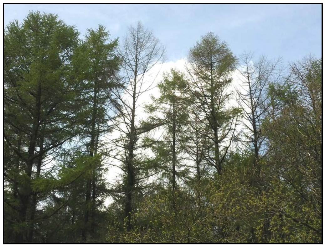
P. ramorum infected Japanese larch, Saint-Cadou forest, Brittany. Photo: © C. Husson, Département de la Santé des Forêts (DSF).

P. ramorum symptoms were first observed on Japanese larch in the Saint-Cadou forest (Brittany), in the northwestern corner of France, in 2015, but the trees were not sampled. A 2016 survey detected many symptomatic trees, but the pathogen was not recovered. In May 2017, the pathogen was isolated from needles, stems and the litter layer. By May 2018, approximately 80% of the trees were symptomatic or dead in the more infected plots (see photo). The stand (24 ha of 50 year-old pure Japanese larch) was removed in June 2018 with approximately 3,000 m<sup>3</sup> of logs harvested and processed into chips for heating. In June 2017, P. ramorum was also confirmed in a mixed forest stand (Japanese larch, oak and sweet chestnut ( Castanea sativa )) in Hanvec, 15 km from Saint-Cadou. Disease prevalence in this stand was estimated to be very low, and the stand was removed at the end of 2017.