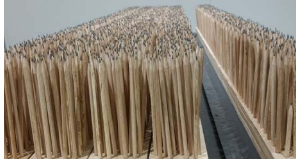
Tanoak pencils.