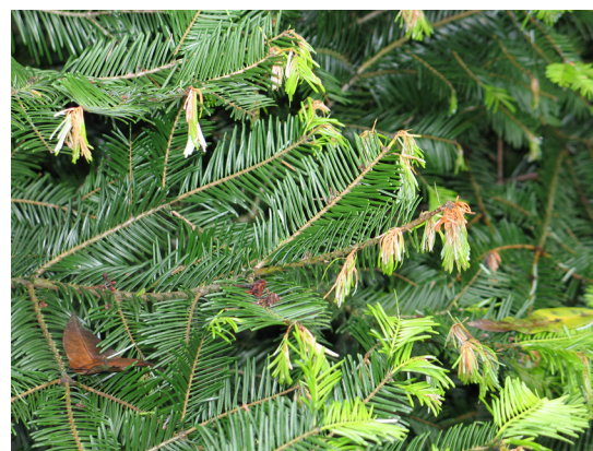
Photo 2. Tip dieback of grand fir caused by P. ramorum in a California Christmas tree plantation. Picture was taken in May shortly after infection following spring rainstorms.