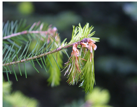
Photo 1. Tip dieback of Douglas-fir caused by P. ramorum in a California Christmas tree plantation.