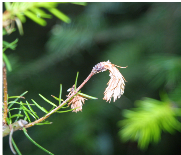
Photo 7. Tip and shoot dieback of Douglas-fir in a California Christmas tree plantation.