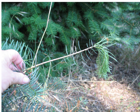
Photo 5. Tip and shoot dieback of white fir caused by P. ramorum in a California Christmas tree plantation in Santa Clara County. The needles of this shoot readily fell off while rubbing the shoot between fingers.