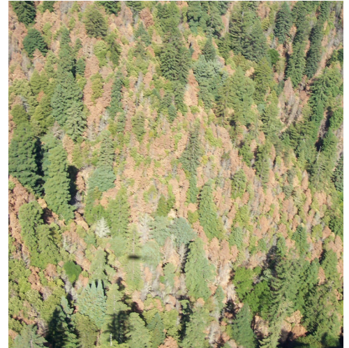
Photo 11: Forest in Marin County with tanoak trees killed by P. ramorum.