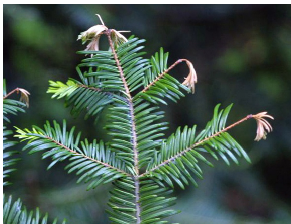
Photo 6. Tip and shoot dieback of grand fir in a California Christmas tree plantation in Santa Clara County. The needles towards the ends of these shoots fell off naturally as dieback progressed from the infected shoot tips down the shoot into the previous year's growth during spring and early summer.