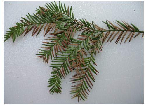
Photo 10: Foliar blight of coast redwood caused by P. ramorum . Photo: Kathy Riley, WSU.

If your farm is located in a quarantined county, contact your local agricultural commissioner or state Department of Agriculture inspector and arrange for your field to be inspected to obtain the necessary shipping permit. Restrictions and exceptions are provided on both the USDA APHIS and the California Department of Agriculture websites. Remember, it is important to check with your county agricultural commissioner on a regular basis to inquire about any changes in quarantine restrictions.