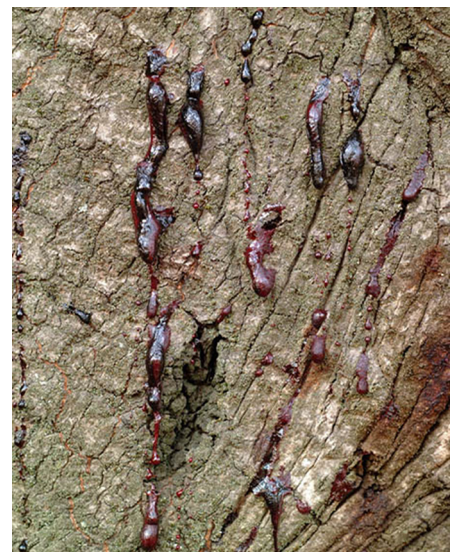
Photo 13. Bleeding canker on a coast live oak trunk.