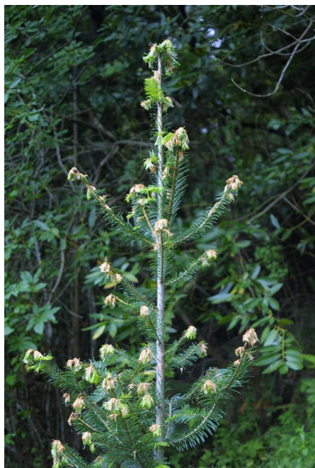
Photo 3. Tip dieback of grand fir caused by P. ramorum in a California Christmas tree plantation. Spores produced on adjacent California bay laurel leaves during spring precipitation have infected most of the emerging shoot tips of this tree.

Initial infection of Christmas trees appears to result from the spread of spores from spore-producing hosts in the landscape surrounding plantings, making it important to be able to recognize symptoms on both conifer and non-conifer hosts. Symptoms caused by P. ramorum on hosts other than conifers can be dramatic, such as when it kills tanoaks (Photo 11), or fairly subtle, as in the case of California bay laurel (Photo 12) where symptoms consist of leaf spots that are often limited to the leaf tip. Symptoms on the various host plant species range greatly, from leaf spots to the death of mature trees. A complete list of host plants and additional pictures of symptomatic plants is available online at www.suddenoakdeath.org . If you are located in a regulated area and are adjacent to a wildland that contains symptomatic hosts, such as dying coast live oak, California black oak, and tanoak with bleeding cankers (Photo 13), and especially California bay laurel with leaf spots on the tips (Photo 12), trees in your planting are potentially at a higher risk of infection than if there are no known infected hosts in your area. California bay laurel is a good indicator plant to check for pathogen presence since it is often the first plant to show symptoms in a newly infested area.