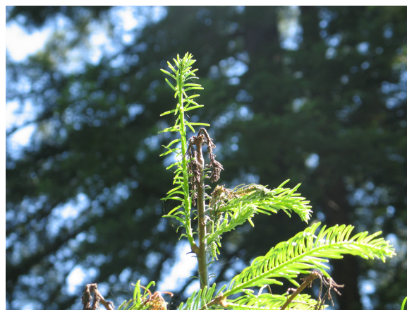
Photo 8. Ramorum dieback of the leader of this grand fir has altered the quality of this Christmas tree top. Infection occurred the previous spring.