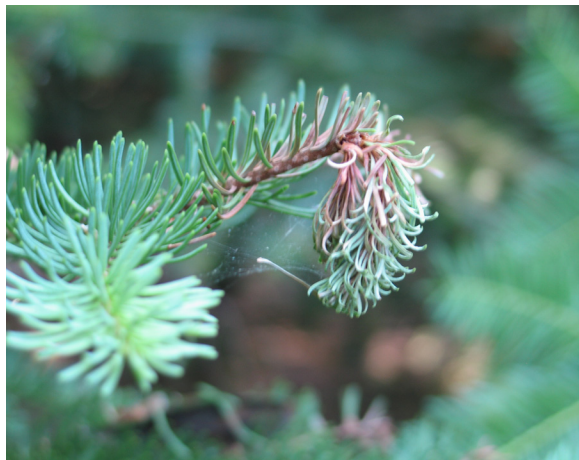
Photo 4. Tip dieback of California red fir caused by P. ramorum in a California Christmas tree plantation.