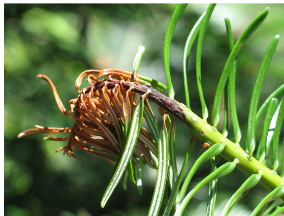
Photo 9: Grand fir with tip dieback caused by P. ramorum . Note that on this particular shoot, the pathogen has not spread far down the shoot into the previous years growth.