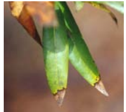
Photo 3. Close-up of leaf spots on California bay laurel