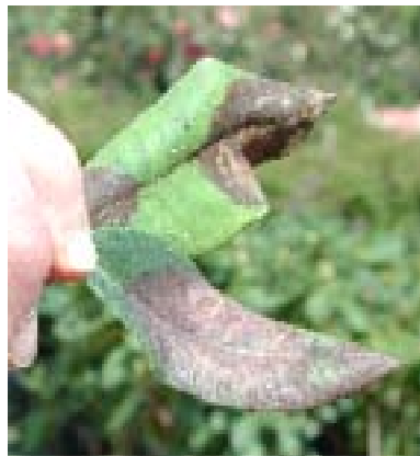
Photo 6. Rhododendron leaf spots.