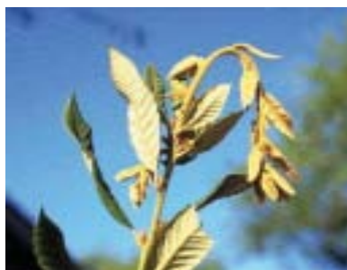
Photo 4a (top). Bleeding cankers on a tanoak trunk. Photo 4b (bottom). Drooping tanoak leaves.