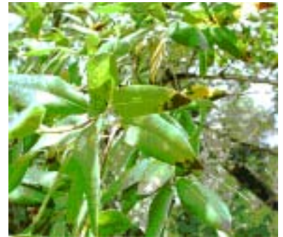
Photo 2. California bay laurel (pepperwood or Oregon myrtle) showing leaf spots typical of Phytophthora ramorum .