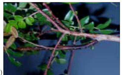
Photo 5. Huckleberry dieback.