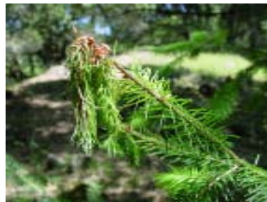
Photo 7. Symptoms on Douglas-fir.