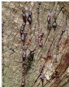
Photo 5. Bleeding cankers on a coast live oak trunk.

A more thorough guide to symptoms and list of susceptible species is available at www.suddenoakdeath.org . You can also find listings for upcoming diagnosis and treatment training sessions online.