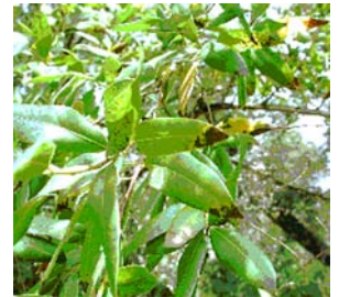
Photo 2. California bay laurel (also called pepperwood, or Oregon Myrtle) showing leaf spots typical of Phytophthora ramorum .