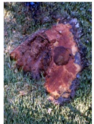
Photo 7. Canker under bark on coast live oak trunk.