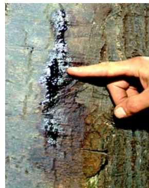
Photo 6. Bleeding cankers on a tanoak trunk.