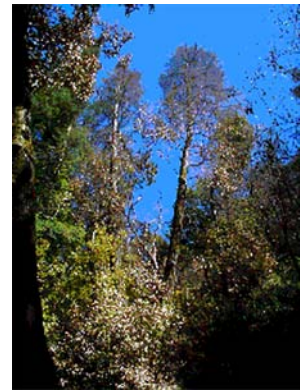
Photo 1. Forest in Marin County with tanoak trees killed by Phytophthora ramorum .