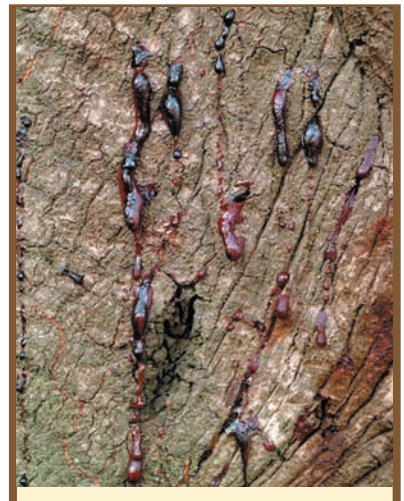
Bleeding cankers on a coast live oak trunk

The probability that your tree is infected with Phytophthora ramorum will be greater if your tree is a susceptible species, exhibits typical symptoms, and is located in an infested area where other trees and plants are showing symptoms. Although positive confirmation can only be done through laboratory testing, diagnosis of Phytophthora ramorum based on visual symptoms can justify taking preventative action if you live in a generally infested area. If you ask a tree care professional to make such a judgment, determine what training or qualifications enable them to do this.