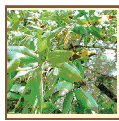
(Left) California bay laurel showing leaf spots typical of P. ramorum (Right) California bay laurel leaf spots