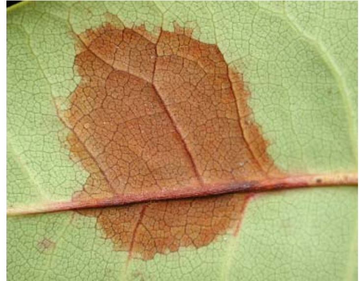
Rhododendron ‘Todmorden’