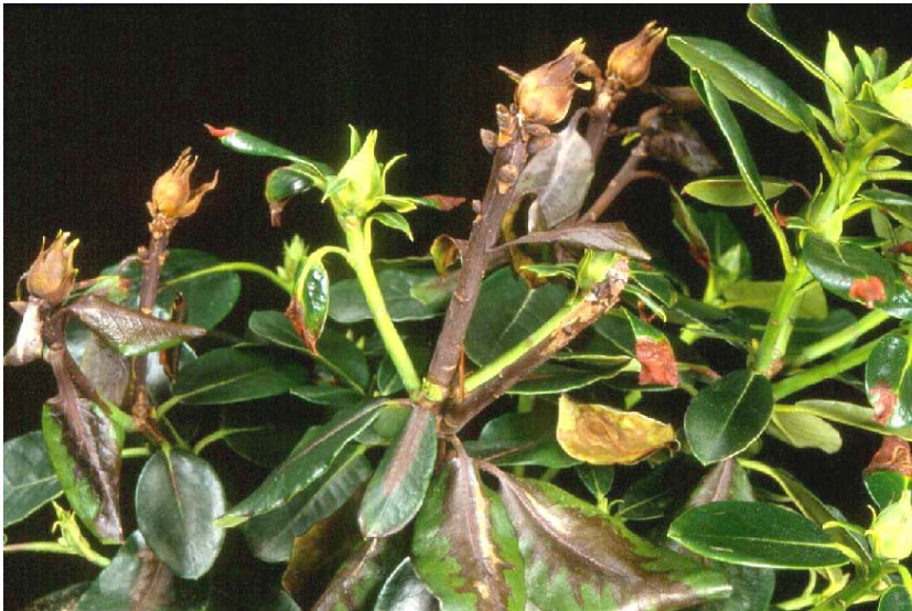
Stem dieback in rhododendron BBA, Germany