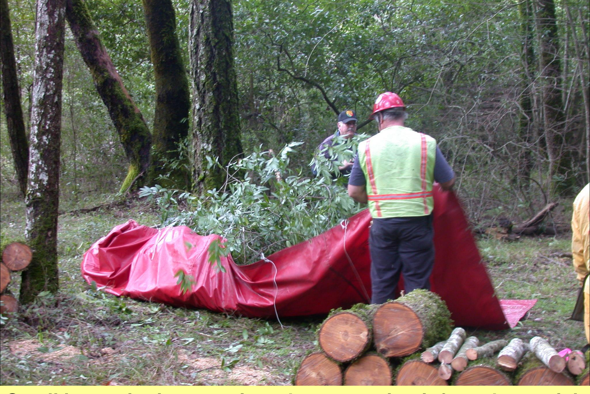
Small lot sanitation practice when removing infected material