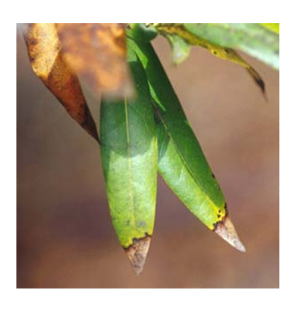
Photo 3 (left). Bay laurel leaf spots. Photo 4 (right). Rhododendron leaf spots.

For the most current list of host plants, go to the COMTF website at www. suddenoakdeath.org.