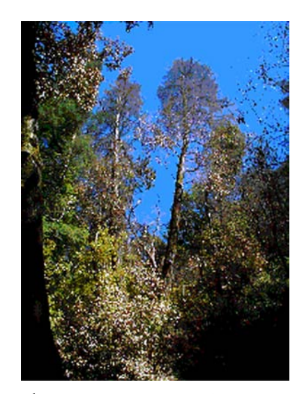
Photo 1. Forest in Marin County with tanoak trees killed by Phytophthora ramorum.