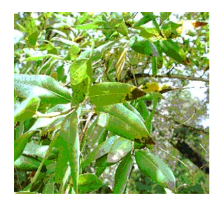
Photo 2. California bay laurel (also called pepperwood, or Oregon Myrtle) showing leaf spots typical of Phytophthora ramorum .