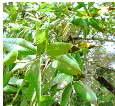
Photo 2. California bay laurel (also called pepperwood, or Oregon Myrtle) showing leaf spots typical of Phytophthora ramorum .