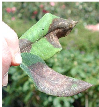
Photo 4 (right). Rhododendron leaf spots.