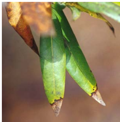
Photo 3 (left). Bay laurel leaf spots.