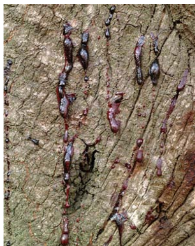
Photo 6 (right). Bleeding cankers on a tanoak trunk.